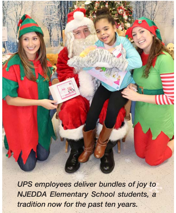
UPS employees deliver bundles of joy to NJEDDA Elementary School students, a tradition now for the past ten years.