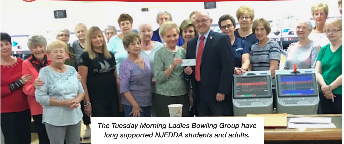
The Tuesday Morning Ladies Bowling Group have long supported NJEDDA students and adults.