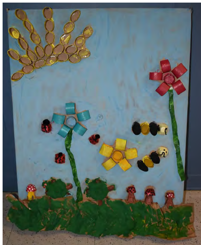
A sample from our Spring Garden Recycled Art Show.