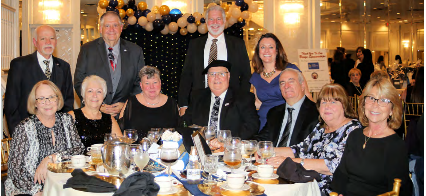
NJEDDA Board members supporting the Special Children's Annual Gala and having fun.